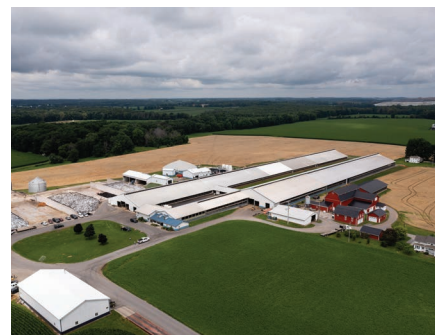
Lawnhurst Farms of Stanley, N.Y., use anaerobic digesters to convert methane, a greenhouse gas released from cow manure, into a source of electricity.

Look at the chart below. Read about the sustainable farming practices in the first column, and then decide if that practice helps conserve energy, conserve water, reduce waste and pollution, or build soil health by putting an "X" in the correct box. You may mark more than one box for each sustainable practice. Then, fill in a way you can help achieve those same environmental goals at home.