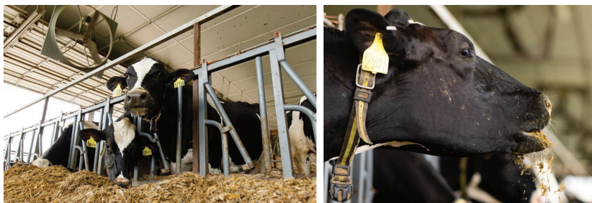
Aurora Ridge Dairy of Aurora, N.Y., uses collars to monitor their cows' health.

Technology has made modern farming more productive. On dairy farms, it also keeps cows healthier and more comfortable. Aurora Ridge Dairy of Aurora, N.Y., uses collars on their cows to monitor the animals' health in real time, much like a fitness watch!