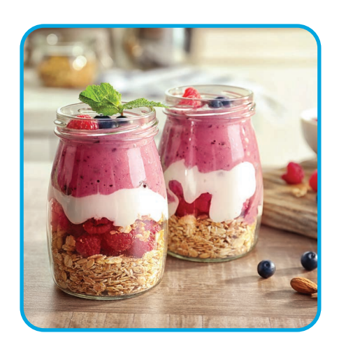
Part 2: Think about your favorite breakfast meals. Or choose from the list at left. How could you improve the meal to start your day in a healthier way? Add a dairy product as part of your daily morning meal. Or substitute one of your food items for a dairy product.